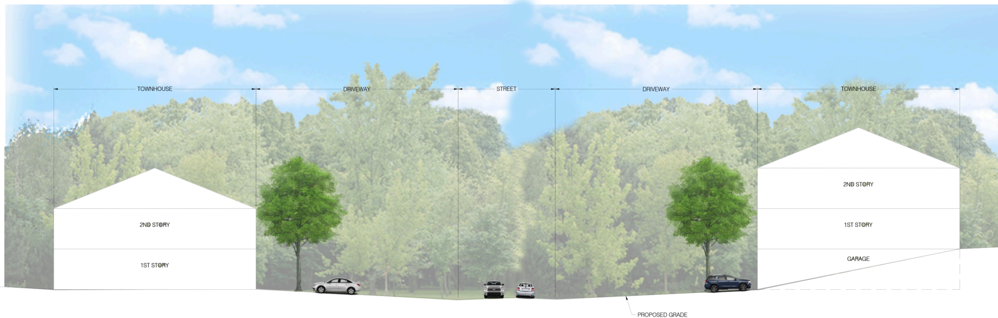
3 STORY/2 STORY STREET SECTION N.T.S.