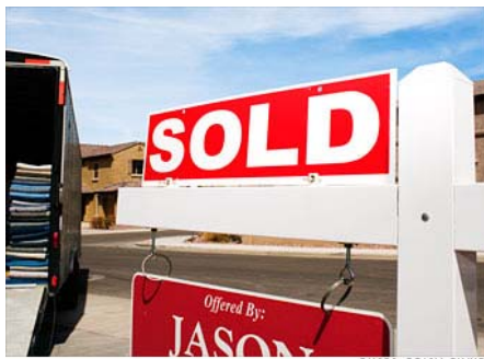
A home off the market in Mesa, Ariz.

The true disaster areas for housing since the bubble burst have been Sunbelt cities such as Las Vegas, Phoenix, and Miami -- places that boasted great job and population growth in the mid-2000s, only to suffer a housing crash that swamped them with empty homes and condos and crushed their economies. But people always want to live in those sunny locales, and their job markets are starting to recover, albeit slowly. In foreclosure markets the inventory problem is far greater because it includes not just traditional resale homes but millions of distressed properties. Fortunately those houses are now such a screaming deal that investors, including lots of mom-and-pop buyers, are purchasing them at a rapid pace. To be sure, some foreclosure markets won't rebound for years because they're both vastly overbuilt and far from big job centers; a prime example is California's Inland Empire, a real estate disaster zone 80 miles east of Los Angeles.