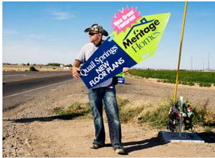
Drumming up sales

Two basic factors are laying the foundation for dramatic recovery in residential real estate. The first is the historic drop in new construction that so amazes Castleman. The second is a steep decline in prices, on the order of 30% nationwide since 2006, and as much as 55% in the hardest-hit markets. The story of this downturn has been an astonishing flight from the traditional American approach of buying new houses to an embrace of renting. But the new affordability will gradually lure Americans back to buying homes. And the return of the homeowner will start raising prices in many markets this year.