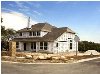
A home under construction in Austin. The number of new homes in the pipeline nationwide is quite low.

Forget stocks. Don't bet on gold. After four years of plunging home prices, the most attractive asset class in America is housing.